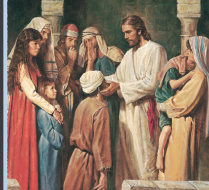
Can you name any other stories from the bible that teach us about caring for others?

Talk to the person next to you and discuss ones that you can remember and what you think they teach us about caring for others.