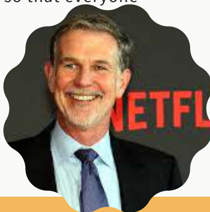
Reed Hastings (Founder of Netflix)