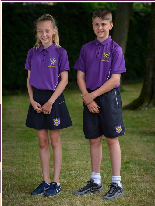
BELOW: PE UNIFORM

ALL ITEMS OF SCHOOL UNIFORM MUST BE CLEARLY MARKED