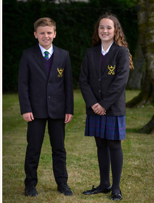
ABOVE: SCHOOL UNIFORM

All PE footwear should be marked inside.