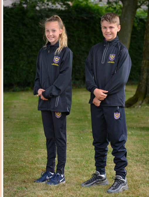
ABOVE: OPTIONAL PE UNIFORM

“Pupils are extremely proud to belong to All Hallows because it is a community dedicated to their needs and potential”