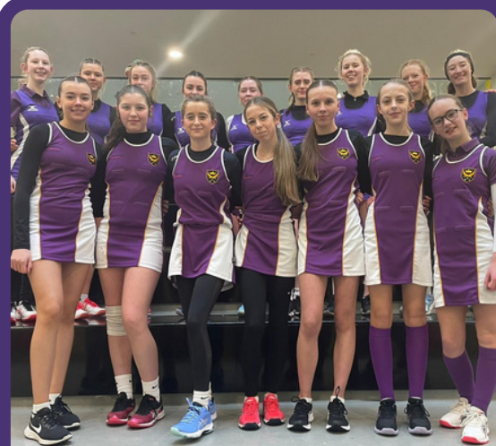
U14s & U16s Netball

On Saturday 14th January, the U14s and U16s netball teams took part in the National Schools Lancashire Netball Tournament at Darwen Vale High School. Both teams braved some very wet and windy weather for their first few games before the sun finally came out! The U14s secured two solid victories over AKS and Scarsbrick School, coming 3rd place in the tournament. The under 16s faced some tough opposition, just losing out by a few goals in all of their matches. It was a great morning of netball with some strong team spirit and resilience shown by all the girls. Well done!