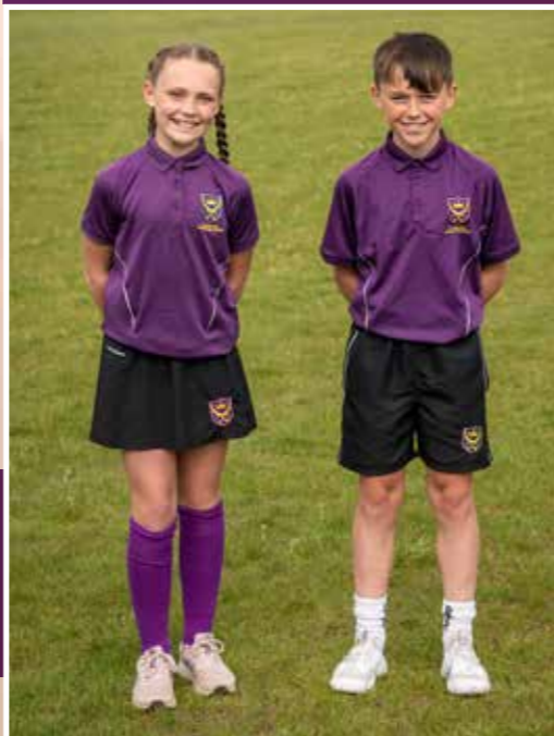
BELOW: PE UNIFORM

ALL ITEMS OF SCHOOL UNIFORM MUST BE CLEARLY MARKED