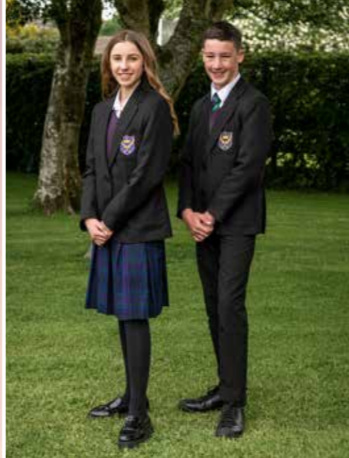
ABOVE: SCHOOL UNIFORM

All PE footwear should be marked inside.