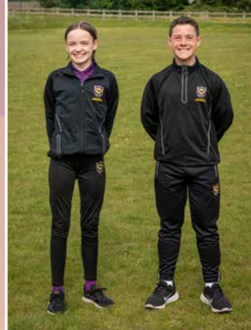
ABOVE: OPTIONAL PE UNIFORM

“Pupils are extremely proud to belong to All Hallows because it is a community dedicated to their needs and potential”