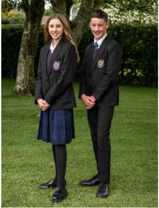
ABOVE: SCHOOL UNIFORM ALL ITEMS OF SCHOOL UNIFORM MUST BE CLEARLY MARKED BELOW: PE UNIFORM

PE kit should have a name tape in every item of clothing. All PE footwear should be marked inside.