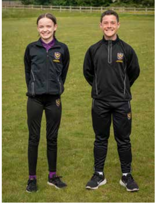
ABOVE: OPTIONAL PE UNIFORM

“Students, staff and governors are justifiably passionate about the sense of inclusion and belonging for all in the school”